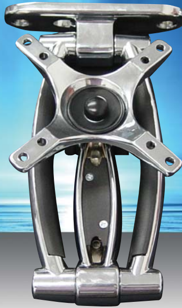
LCD Panel Double Arm Mount (AV601-D)