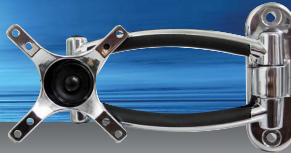
LCD Panel Single Arm Mount (AV601-S)