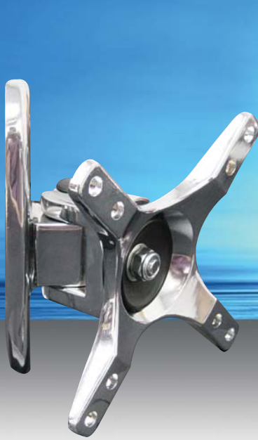
LCD Panel Flush Mount (AV601-W)